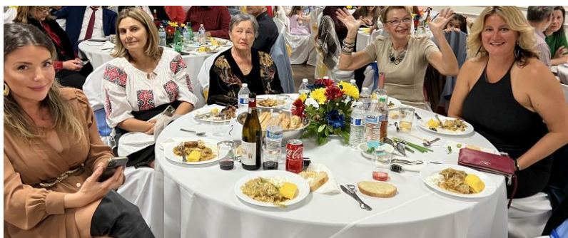
Delicious food. A real traditional Romanian feast.

There is also the aspect that we are used to Romanian community events being organized by older people, making us think that only they are interested in meeting each other, to soothe their nostalgia. But this event showed that there are also young people passionate about Romanian values. How nice!