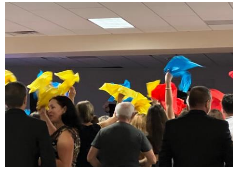
The traditional handkerchiefs used in the hora dance, in the colors of the Romanian flag

There are a few important things to note: two of the organizers were not of Romanian origin; the event was strictly based on volunteering; the event was designed for all ages; and the organizers were young and not older people as we are used to the events of recent years.