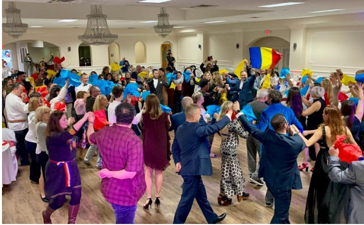
The "hora" dance