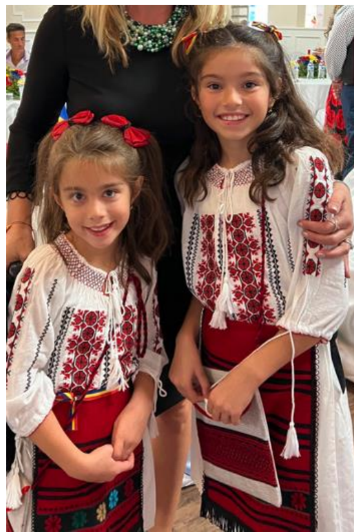
Two little girls in Romanian folk costumes and the traditional" ie, "blouse"

Romanian music and from other European countries as well as American music, pop and popular music were played, in a successful musical show for all tastes and all ages. The hora was danced, but also "Brasoveanca", "Dansul Pinguinului" and Macarena. For the Hora dance, red, yellow, and blue paper handkerchiefs were distributed to people at the tables. This was another nice note to mark the Romanian character of the event.